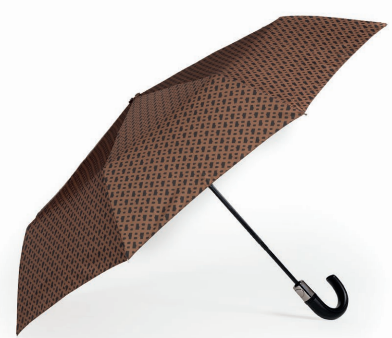
HUF310Y - Monogram Pocket umbrella camel