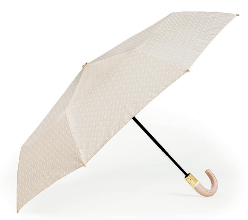
HUF310X - Monogram Pocket umbrella nude