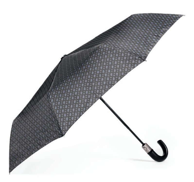
HUF310J - Monogram Pocket umbrella dark grey