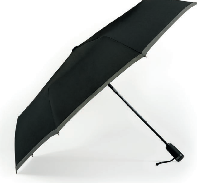
HUF007A - GEAR Pocket umbrella black