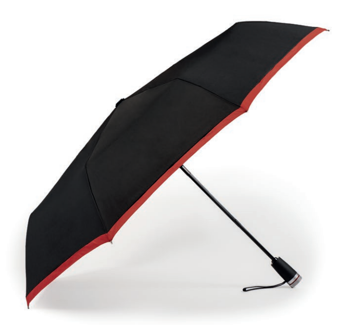
HUF007F - GEAR Pocket umbrella khaki HUF007P - GEAR Pocket umbrella red