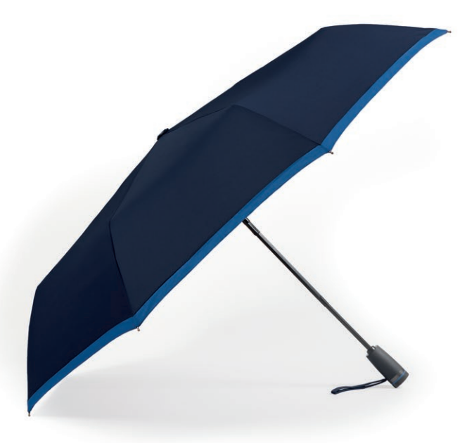
HUF007L - GEAR Pocket umbrella blue